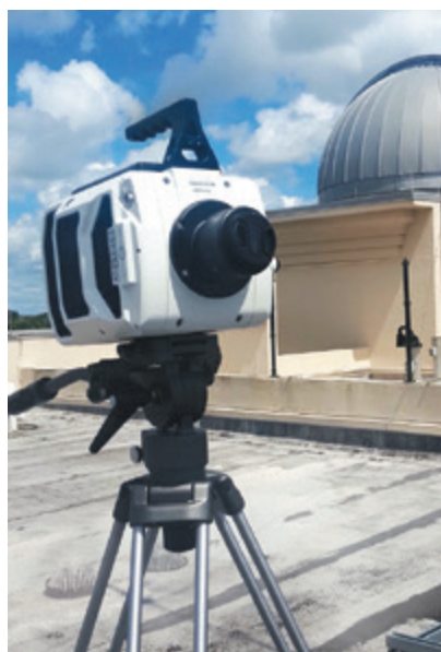
Phantom v1210 digital ultrahigh-speed camera.